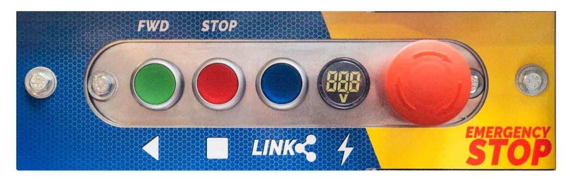
End conveyor of ANY run to have the LINK button out and not illuminated