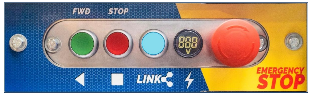
Start and mid conveyors in the run have illuminated LINK button

Every conveyor must have the LINK button pressed in and illuminated. Except the last conveyor in the run. The last conveyor in a chain must have the LINK button in the out position and not illuminated.